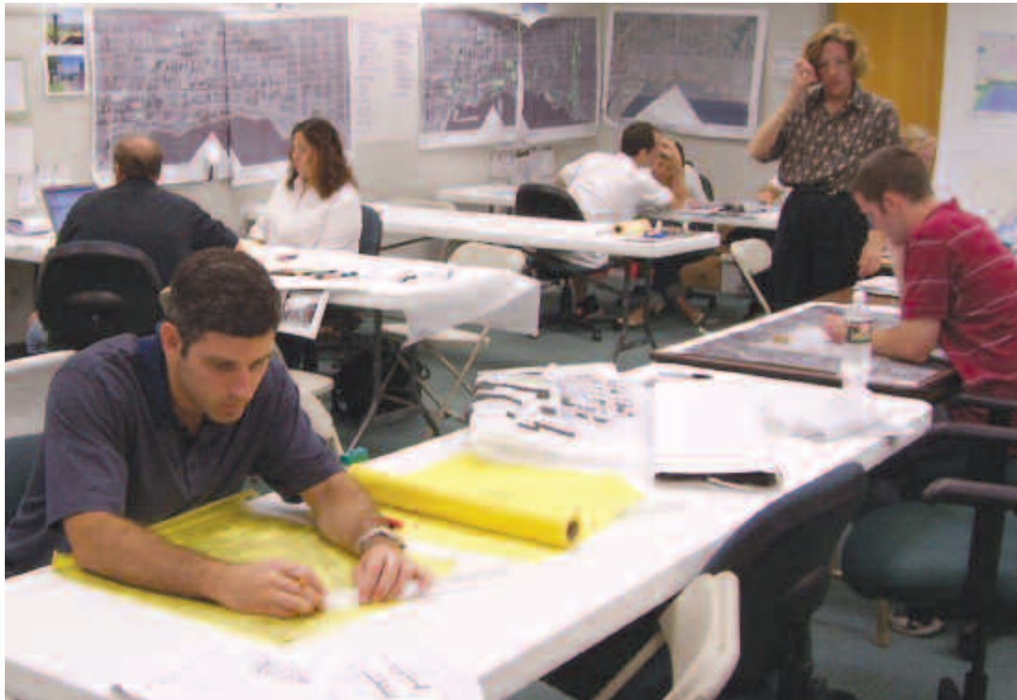
Charrette team members at work.